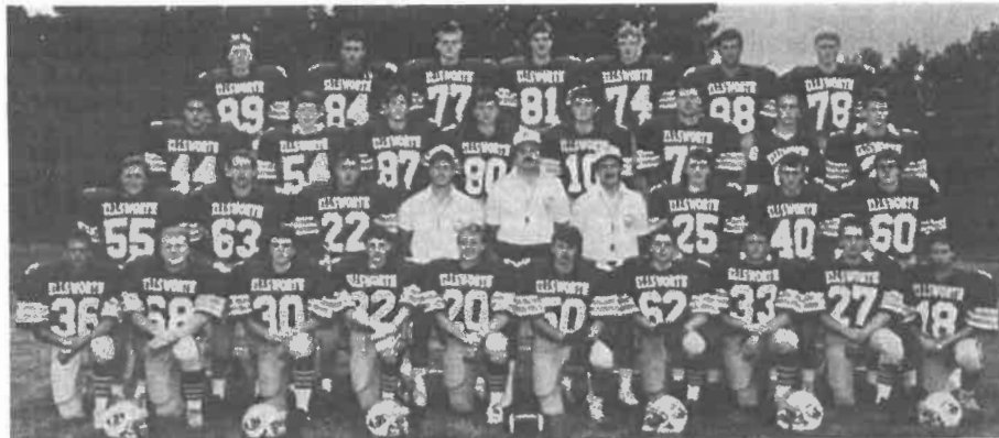
ELLSWORTH — FOOTBALL CHAMPIONS (DIVISION 3) — 1990-91