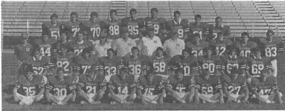
MONROE — FOOTBALL CHAMPIONS (DIVISION 2) — 1990-91