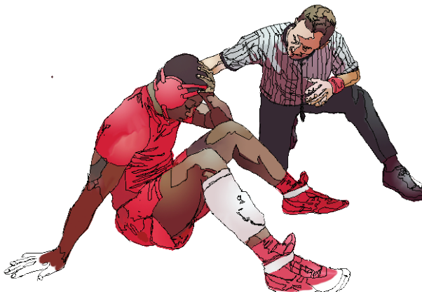
Frame 4: Wrestler A then sustains an injury, this time to the head. Because there is no AHCP, the official stops the match due to signs, symptoms and behaviors consistent with a head trauma. Wrestler B wins by default.