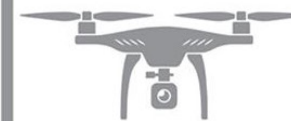
NO DRONES or RC VEHICLES