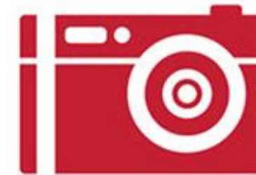
CAMERAS lenses 4" and smaller