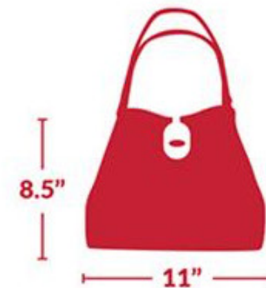
BAGS no larger than 8.5" x 11"