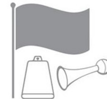
NO NOISEMAKERS or FLAGS/SIGNS ON A STICK