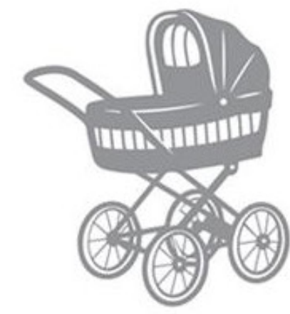
NO STROLLERS or BABY CARRIERS