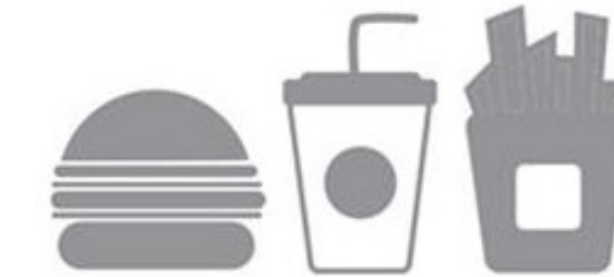
NO ALCOHOL, FOOD or BEVERAGES