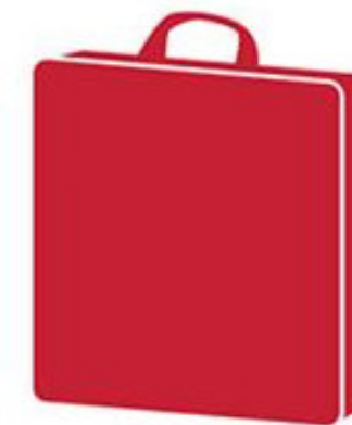
SEAT CUSHION not more than 16" wide