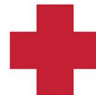
ITEMS RELATED TO A MEDICAL CONDITION