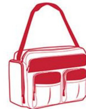
DIAPER BAG with child