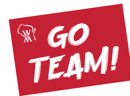
BANNERS, FLAGS, SIGNS not on a stick