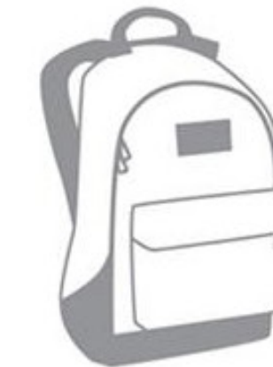
NO BAGS LARGER THAN 8.5" x 11" (including backpacks)