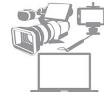
NO LAPTOPS, VIDEO RECORDERS or SELFIE STICKS