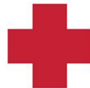
ITEMS RELATED TO A MEDICAL CONDITION