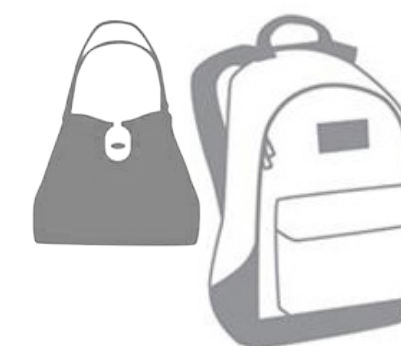
NO BACKPACKS or PURSES