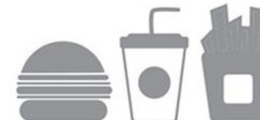
NO ALCOHOL, FOOD or BEVERAGES