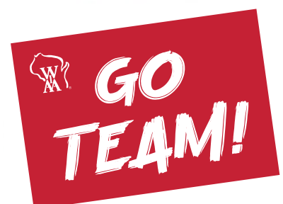
BANNERS, FLAGS, SIGNS not on a stick