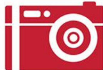
CAMERA lenses 4" and smaller