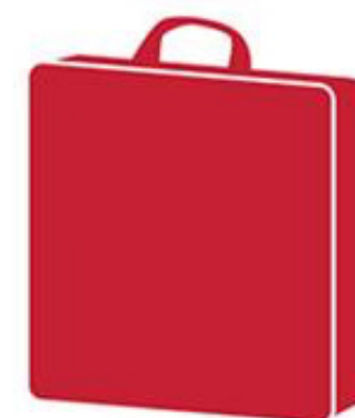
SEAT CUSHION without a zipper