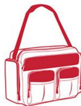
DIAPER BAG with child