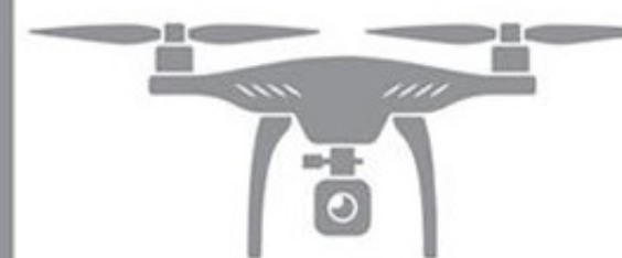
NO DRONES or RC VEHICLES